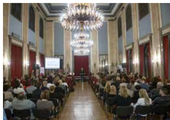
Opening ceremony, Belgrade City Hall